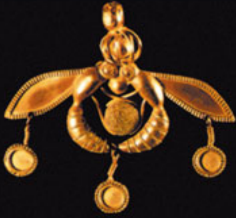
The gold pendant from the Iraklion Archaeological Museum in Crete depicts two bees. At that time, (between 2,500 and 1,000 B.C.), bees were considered to be a symbol of woman-oriented community building.