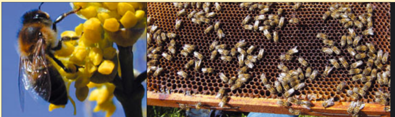
Poisonous pollen? Increasingly sprayed insecticides do harm to the bees.