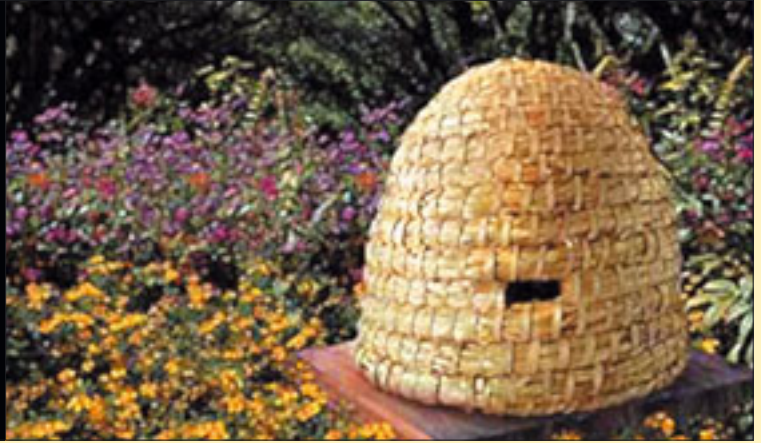
Humans have been harvesting honey for thousands of years. Nowadays, however, the dwellings of the bees are usually built functionally.

gether, only through her does it have a centre. She secures the continued existence of the hive and its survival by providing for an increase in the number of its members via her egg-laying; she passes on life. The various tasks within the colony are distributed among the bees. They consist in